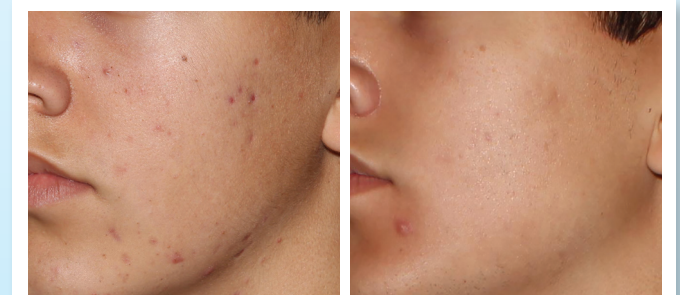
3.5 months post 9 treatments