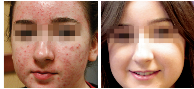
1 month post 9 treatments