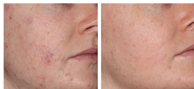
8 weeks post 5 treatments